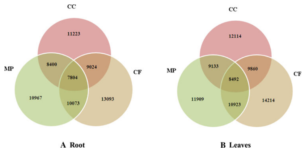
Fig. 2 Venn diagram of G. pentaphyllum data set showing numbers annotated to one, a combination of two and/or all three GO vocabularies (MF molecular function, BP biological process, CC cellular compound)