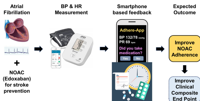
Figure 1 Schematic diagram of expected improvement in NOAC adherence by regular measurement of BP, HR and smartphone feedback in patients with atrial fibrillation. BP, blood pressure; HR, heart rate; NOAC, non-vitamin K oral anti-coagulant.

prevention. Poor drug adherence or failed persistence would increase the risk of stroke, and this may lead to an increase in public healthcare costs. 12